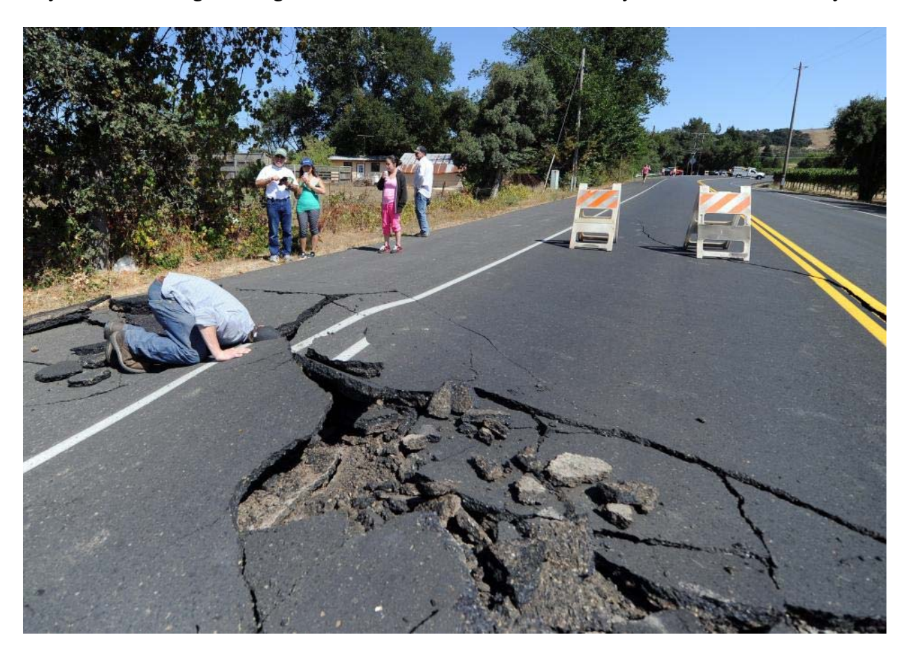
A buckled highway just outside of Napa, California, after earthquake struck the area in the early hours of August 24, 2014.

The other fault zones in the region—Calaveras, Concord—Green Valley, Greenville, Rodgers Creek, San Gregorio and perhaps the most notorious San Andreas fault—all crisscross through the Bay Area region. Hayward crosses right through the football stadium of the University of California, Berkeley.